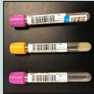
Left to right

Laboratory analyzers cannot readily accept the barcodes on these containers